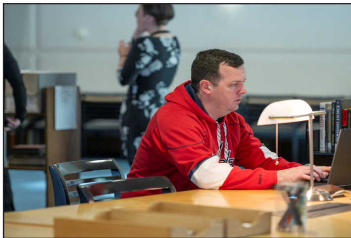
A Command and General Staff College (CGSC) Art of War Scholar searches through Ridgway Library's online catalog to further his research topic during their annual visit. Those wishing to visit the U.S. Army Heritage and Education Center (USAHEC) to conduct in-person research can make an appointment by visiting USAHEC's main website.