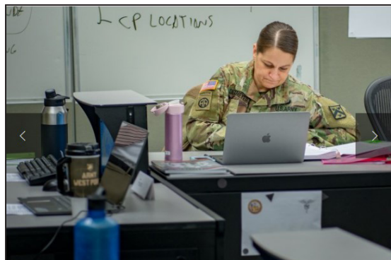
A Nevada National Guard Soldier works on an assignment for class.

Are you a veteran who served at least two periods of service? In other words, did you reenlist? If so, there's a chance that you're eligible for additional G.I. Bill benefits.