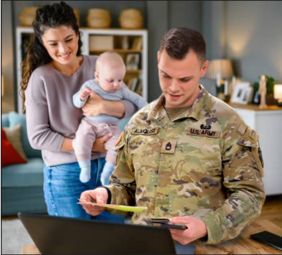
A Soldier and his family plan for their financial future by discussing their finances in preparation for military retirement.

As you begin to plan for retirement, one of the necessary steps is discussing your financial plans. For your entire career, you know when you will receive your paycheck and how much it will be. You receive a Basic Allowance for Housing (BAH), free medical care, and financial assistance for school. For most of your career, you probably didn't have to plan for many contingencies. However, after retirement, life can be less predictable. A financial plan can help you succeed in retirement by preparing you, and your family, for both the expected and unexpected.