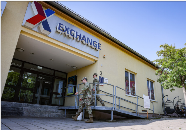
Soldiers walk into the Exchange retail store at U.S. Army Garrison Bavaria, Hohenfels, Germany

Veterans and military spouses have a home with the Exchange. More than 60,000 veterans and spouses have been hired since 2013. Military spouses can advance in their careers while supporting their families and our Nation's military mission—which is critical to force retention.