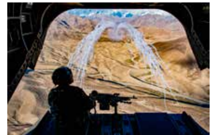
A U.S. Army crew chief assigned to Task Force Brawler, flying on board a CH-47F Chinook, observe the successful test of threat countermeasures during a training flight in Afghanistan, March 14, 2018.

Afghanistan