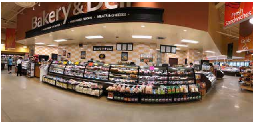
Inside the new deli, bakery, and sushi bar at Tyndall Air Force Base Commissary in Florida.