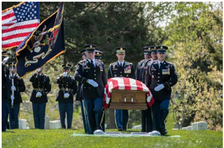
The U.S. Army Honor Guard, the 3d U.S. Infantry Regiment (The Old Guard) Caisson Platoon, and the U.S. Army Band, "Pershing's Own", conduct the funeral of former Secretary of the Army Togo D. West Jr. in Section 34 of Arlington National Cemetery, Arlington, Virginia, April 26, 2018.

Arlington National Cemetery invites everyone to take the survey and continue the robust and candid national dialogue.