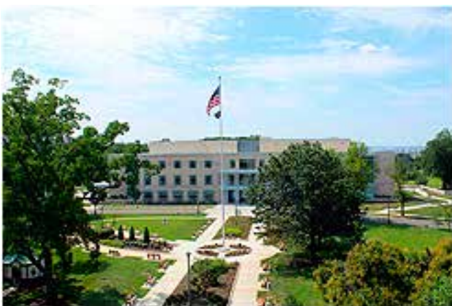
Washington DC Campus