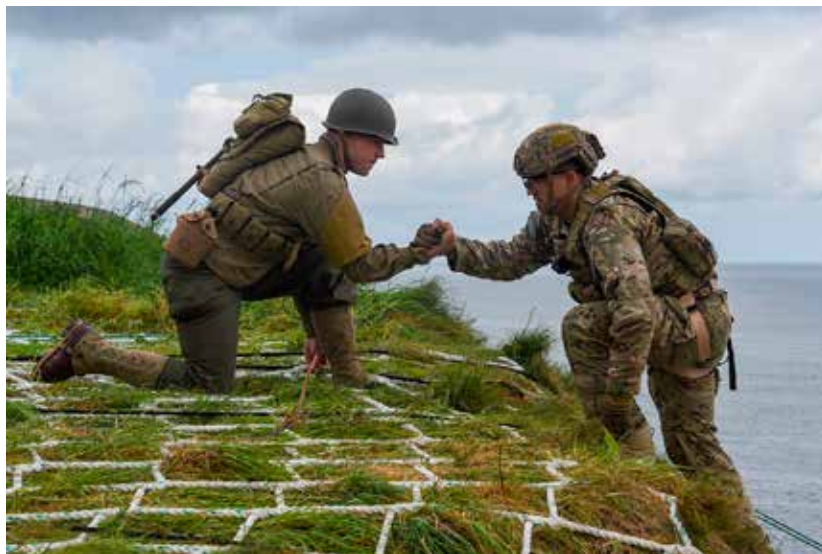
Soldiers with 75th Ranger Regiment scale the cliffs like Rangers did during Operation Overlord 75 years ago at Omaha Beach, Pointe du Hoc, Normandy, France, June 5, 2019.

ETS-SP is a public-health approach dependent upon participation from service members, veterans and sponsors.