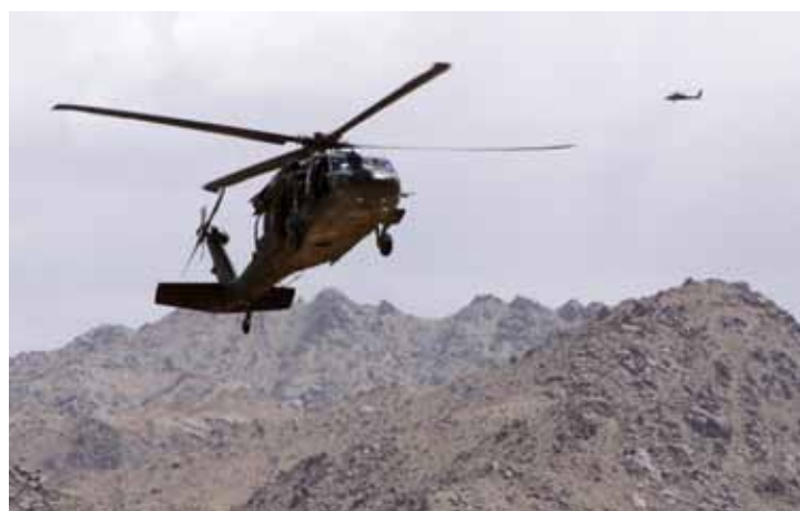
A UH60 flares for landing in Afghanistan.