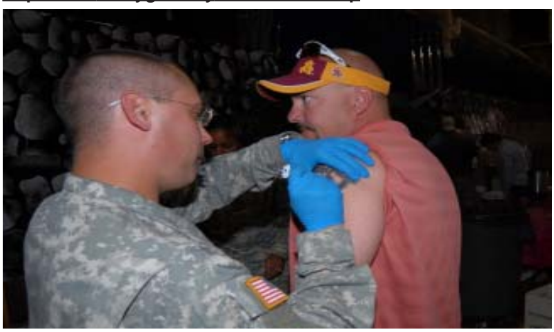
An active duty Soldier gives a retired Soldier a shot in the arm at the Ft Carson, CO, RAD.

Here are the RADs scheduled for this year so far. For information, contact the RSO hosting the event (Army RSOs are listed on page 13. For other services, please contact the installation). For updates, go to <a href="http://www.armyq1.army.mil/rso/rads.asp">http://www.armyq1.army.mil/rso/rads.asp</a>.