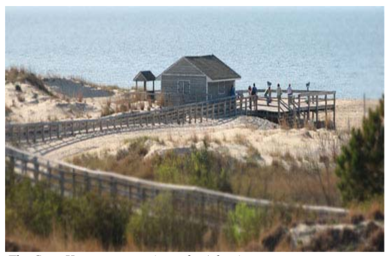
The Cape Henry property is on the Atlantic coast.

a hotel as well as log cabins and bungalows. You can make reservations by going to <a href="http://www.capehenryinn.com/reservations.htm">http://www.capehenryinn.com/reservations.htm</a> or calling (757) 422-8818. Reservations Office hours are Monday through Friday from 0830 to 1700 hours Eastern Time. They are closed Saturday, Sunday, and all Federal holidays. Due to heavy call volume, you may experience an extended hold time. Call volume is heaviest on Mondays and Tuesdays.