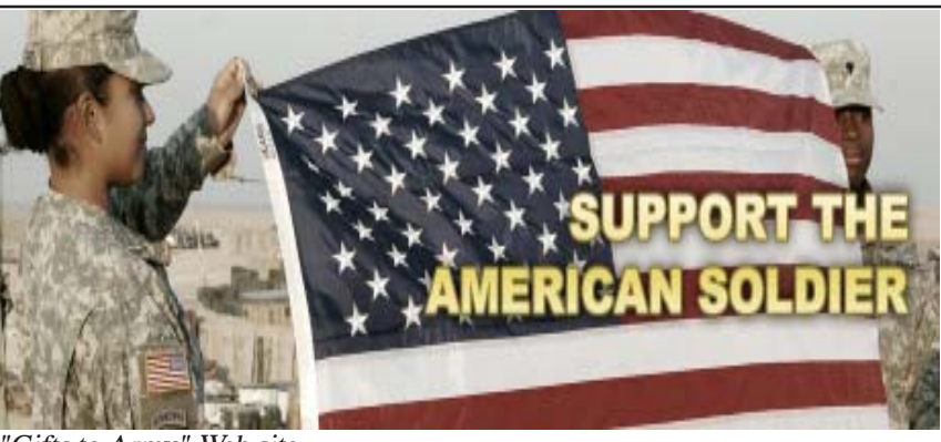
"Gifts to Army" Web site

Nov 1 Westfield, MA Air Guard/ Army Reserves