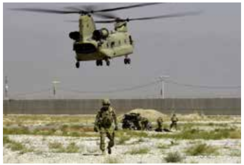
Task Force Shadow Soldiers conduct a Forward Armament and Refueling Point operation, as well as a mobile Tactical Operation Center setup, Aug. 4, 2018.

The retail cost of hearing aids can run from a few hundred dollars to a few thousand. The RACHAP program may be a convenient benefit for you and may be a significant cost saving over the private sector.