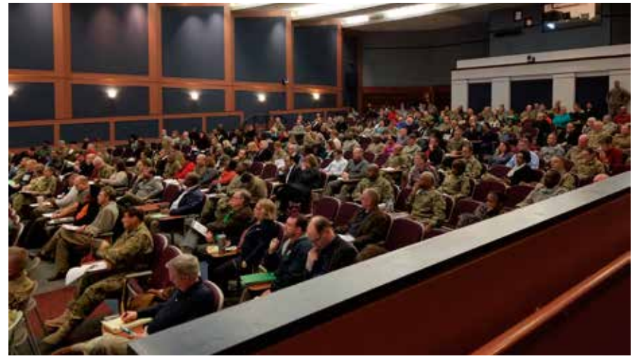
The 99th Readiness Division hosted a pre-retirement briefing on March 17, 2018 at Fort Belvoir.

While all this information is available online, we bring the subject matter experts from each of the specific areas to better explain the benefits you are eligible to receive. They are also available to discuss your specific situations so you have the information you need to make informed decisions.