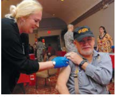
Flu shots are a feature of many RADs like this one at Ft Knox, KY.

Why should you go to a Retiree Appreciation Day (RAD)? Your RAD is designed just for you – Retired Soldiers and spouses – with speakers and events planned by your Retirement Services Officer (RSO) and Installation Retiree Council.