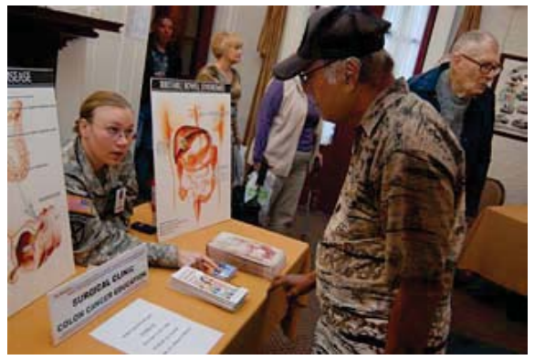
Retiree Appreciation Days like this one at Ft. Knox, KY, are good places to learn about preventive health care.