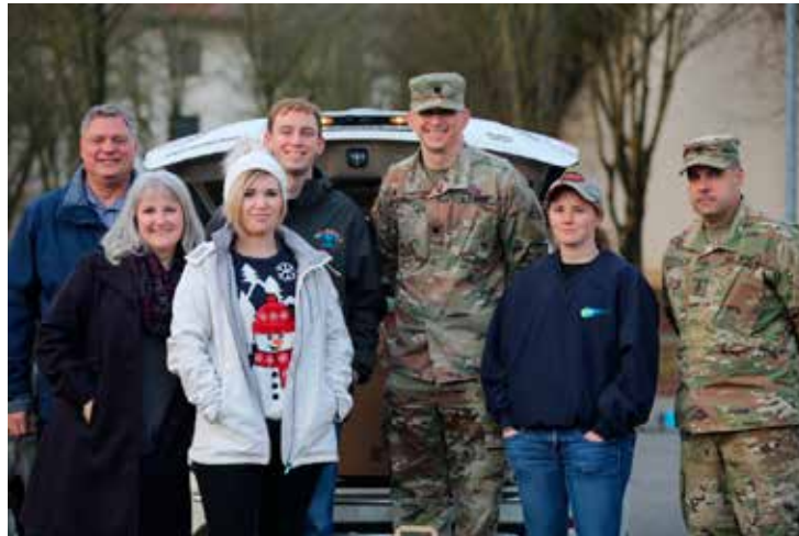
Members of the Hohenfels community pose for a picture before the Holly Jolly Hohenfels event in Hohenfels, Germany Dec 23, 2019. This event provides Christmas cheer for single soldiers on Hohenfels who are away from their families.

SBP is a very complicated law and you have to consider what's right for you and your family situation. For more details, talk to your retirement services officer .