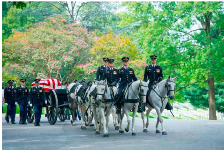
3d U.S. Infantry Regiment (The Old Guard) Caisson Platoon conducts military funeral honors with funeral escorts at Arlington National Cemetery, Arlington, Va., Sept. 22, 2017.